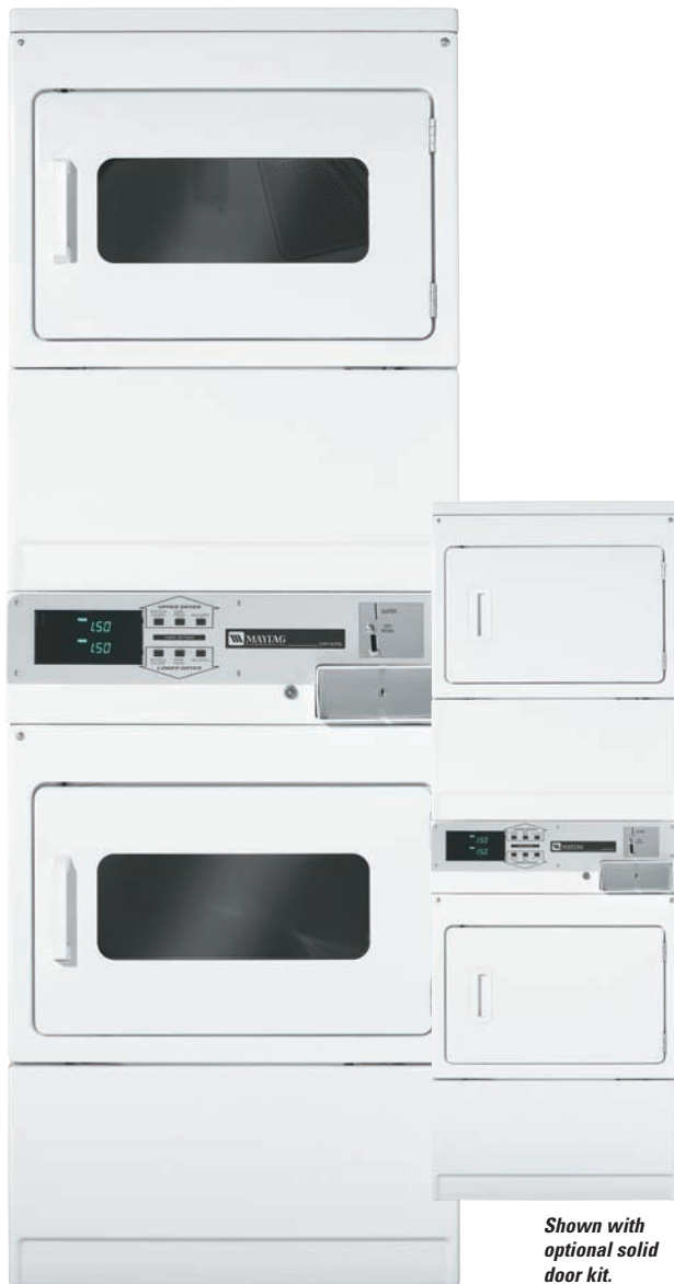
Shown with optional solid door kit.

Maximizing your equipment investment for over a half century.