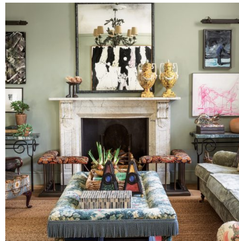
( https://galeriemagazine.com/hubert-zandberg-london/ )

Sara Story and Standard Architecture | Design Collaborate on a Los Angeles Home for Sprinkles founder Candace Nelson ( https://galeriemagazine.com/sara-story-standard-architecture-design-sprinkles/ )