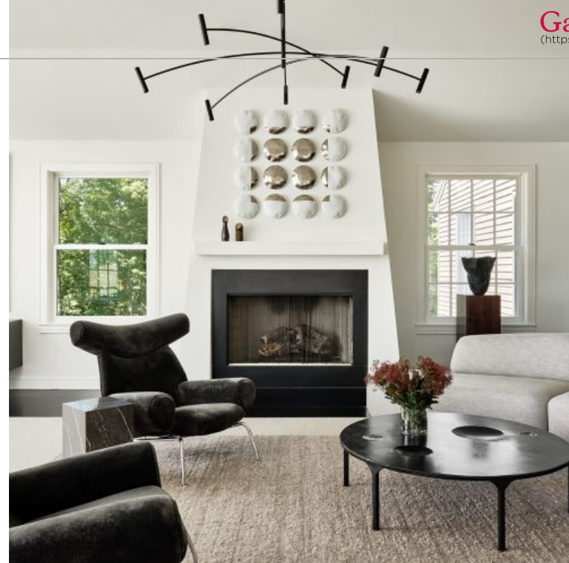
( https://galeriemagazine.com/todd-raymond-upstate-new-york/ )

INTERIORS ( https://galeriemagazine.com/category/home-architecture/ )