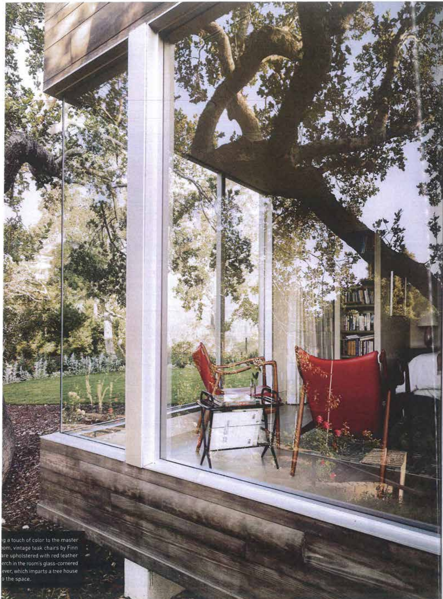
Adding a touch of color to the master room, vintage teak chairs by Finn are upholstered with red leather. The perch in the room's glass-cornered overhang, which imparts a tree house feel to the space.