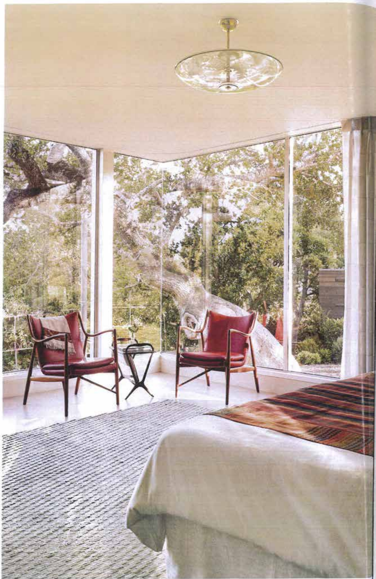
Custom-colored bamboo-and-wool rug by Niba Rug Collections lends texture to the master bedroom. The vintage lighting fixture is by Fontana Arte, and the draperies were specified by Fabric Walls with a black and white textile. A Nigerian textile adorns the bed.