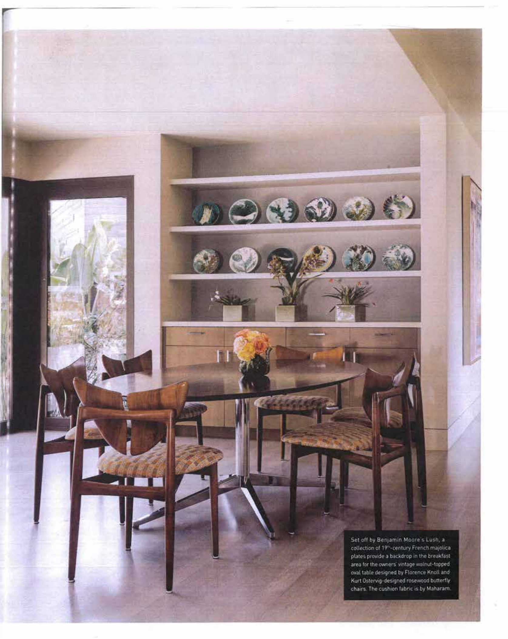
Set off by Benjamin Moore's Lush, a collection of 19 th -century French majolica plates provide a backdrop in the breakfast area for the owners' vintage walnut-topped oval table designed by Florence Knoll and Kurt Ostervig-designed rosewood butterfly chairs. The cushion fabric is by Maharam.