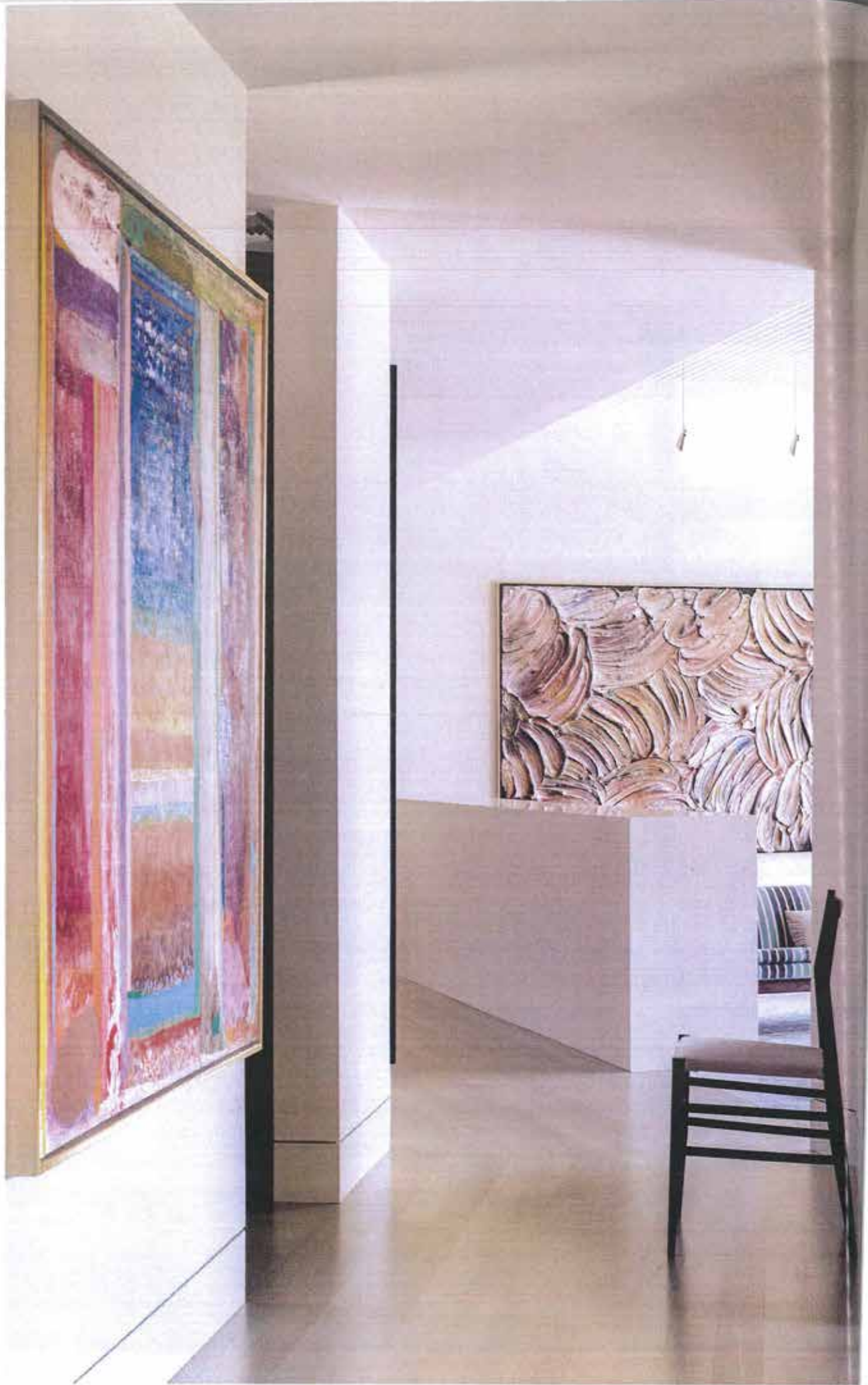
Diana , from Robert Natkin's Apollo series, hangs in the hallway, which features custom-colored quarter-sawn white-oak flooring by Tree Lovers Floors. A partial low wall made of Caesarstone sections the living room from the entry.