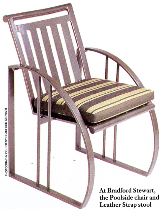
At Bradford Stewart, the Poolside chair and Leather Strap stool