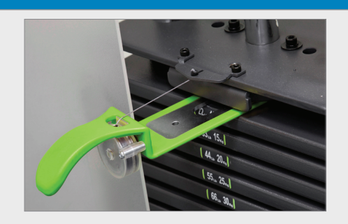
Our stacks feature sound dampeners and magnetized selector fork for maximum stability.