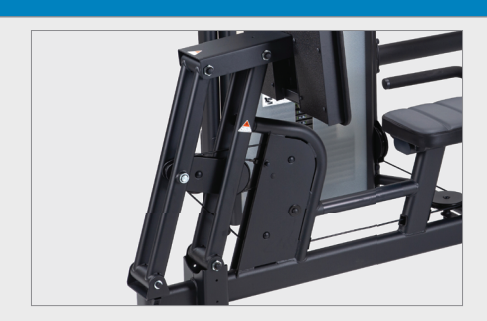
Unique 4-bar linkage system keeps the foot plate at a consistent angle for optimal lower body alignment and proper biomechanics