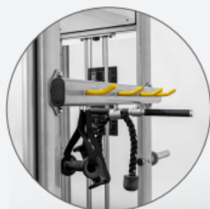
Accessory Storage and Bar Storage