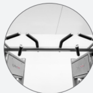
Multi-Grip pull up handles