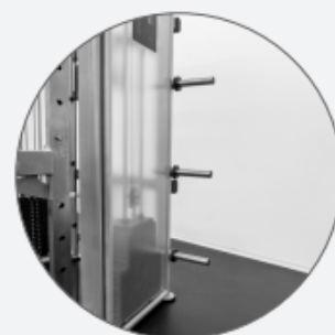
6 Weight peg holders