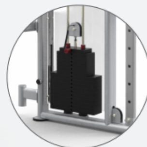
Dual 220 lb High Quality Steel Plates