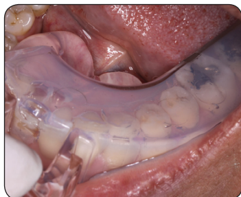
Water clear Template Clear provides excellent visibility throughout the provisional process. After loading the tray with a provisional composite and re-seating, potential voids are easily identified and if a light cured provisional material is used (ie. veneer temps), Template Clear's clarity will allow light curing directly through it.