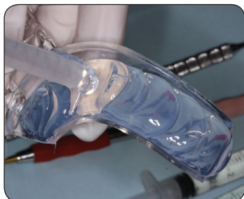
Template Clear is best used with a non-perforated tray for maximum clarity and can be used in full arch or sectional trays.