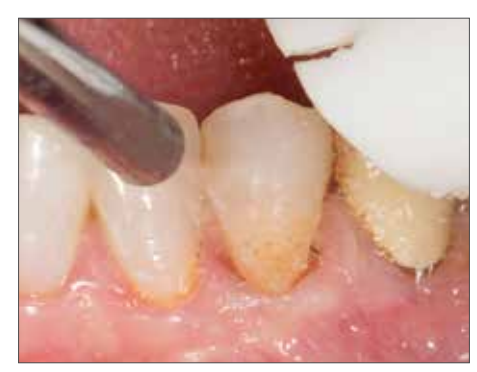
Apply a firm air/water spray to remove residual coagulum.