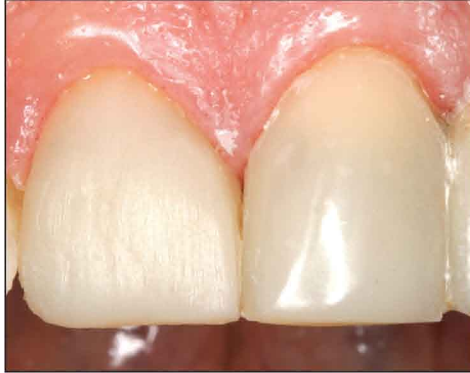
2. Renamel Nano Light Cured Nanofill Composite veneer adapted and light cured