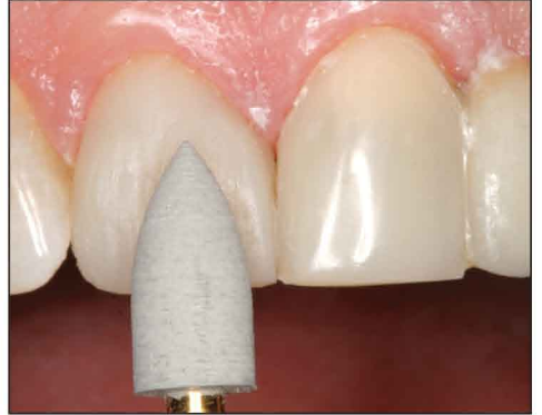
3. Initial labial lobe form shaping to contour with pointed #08 Shape and Shine