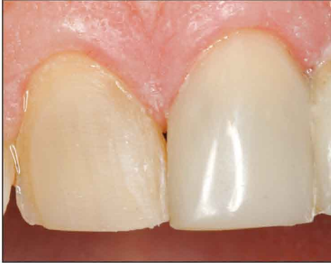
1. Upper right central incisor labial veneer preparation