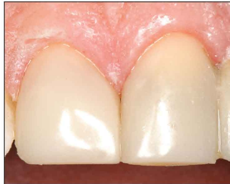
5. Final high luster composite surface created using the Shape & Shine polishers