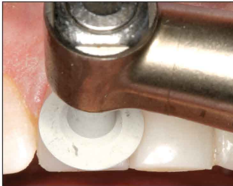
4. To mimic the adjacent central, the Shape & Shine #02 wheel is used to create a flat surface topography