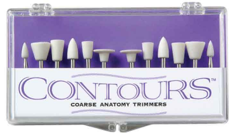
CONTOURS Assorted 12-pack # 078912

CLINICIAN'S CHOICE has made these long-lasting coarse anatomy trimmers available in the same 6 shapes made popular by the REALITY 5-STAR rated D•FINE™ Polishers for Hybrid Composites, so there's a CONTOURS trimmer perfectly suited for every anterior and posterior restoration you undertake.