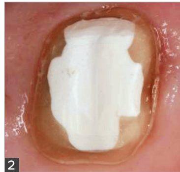
2 The Zircules zirconium dioxide nano-filler creates superior radiopacity and hardness giving it the feel of natural dentition. Zircules cuts beautifully, resulting in a smooth transition from core to tooth; without gouging.

ZIRCULES 25 mL CARTRIDGES A2 406922 A3 406923 Blue 406924 White Opaque 406921