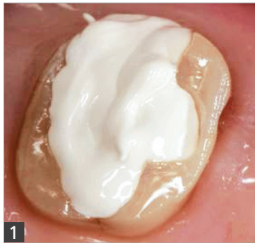
1 Zircules has an ideal consistency. It flows easily, yet it won't slump.