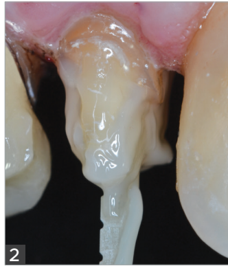
2 Post cemented with Zircules and core build-up performed with direct application of Zircules using auto-mix integrated needle tip. Note that the material stays in place after delivery without slumping.