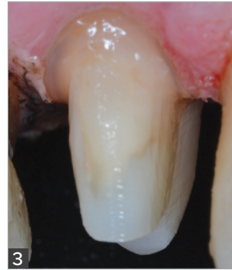
3 Final preparation. Note the smoothness of preparation with perfect blending between dentin and Zircules. Also, no ditching is present on preparation due to the mechanical properties of Zircules which cuts just like dentin.