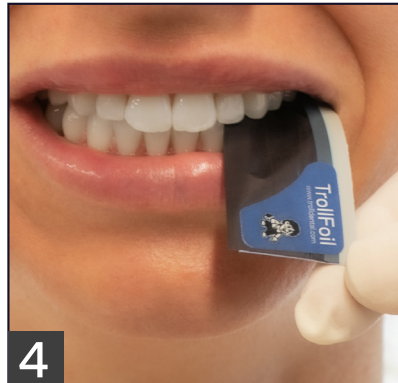
4 Position TrollFoil in patients mouth just before upper and lower arches touch. Instruct patient to gently bite down with only tapping the Foil 2-3 times. TrollFoil is sensitive to pressure since it is a Foil and not a paper.