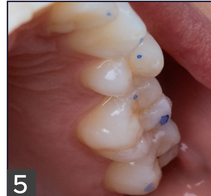
5 Instruct patient to open mouth and remove TrollFoil. Clearly see distinct markings on upper and lower arches. Marks on both wet and dry surfaces, gold & porcelain.