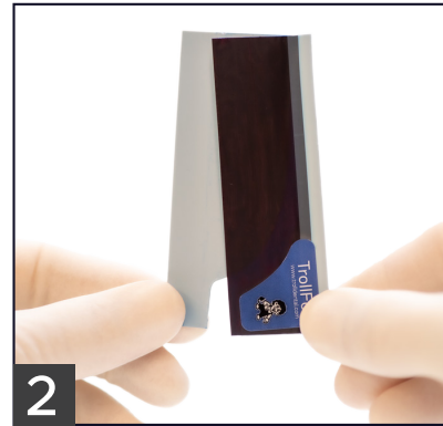
2 Hold TrollFoil with both hands. Your right thumb on the blue sticker and left thumb on the back gray frame near the widest area of the frame.