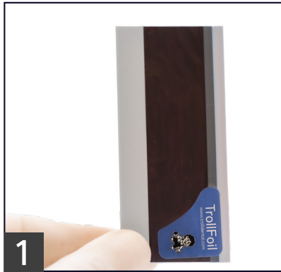
1 Comes pre-mounted on its own gray frame no need for forceps. Easily remove 1 TrollFoil from box at a time as needed.

TrollFoil 4.5 microns is the thinnest articulating foil ever made. Research shows that the thinner the articulating foil, the better. Thick articulating paper generates a less uniform and larger occlusal contact area than the occlusal area marked with thin articulating foil. TrollFoil 4.5 is double-sided blue color mounted on its own frame eliminating the need for forceps. Marks on wet, dry, and highly polished surfaces, at 4.5 microns thick this super-thin foil gives you very precise markings.