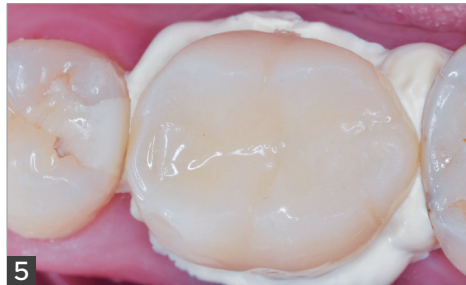
5 Express Cling2® Temporary Cement directly into the provisional crown. Seat the provisional crown within the 30 second working time. After a 60 to 90 second setting time, remove excess Cling2 from the preparation margins.