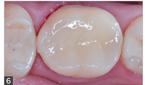
6 The result is a strong, durable, esthetic Inspire provisional crown.