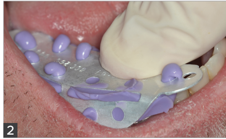
2 Once seated, intraoral set time is approximately 30-45 seconds.