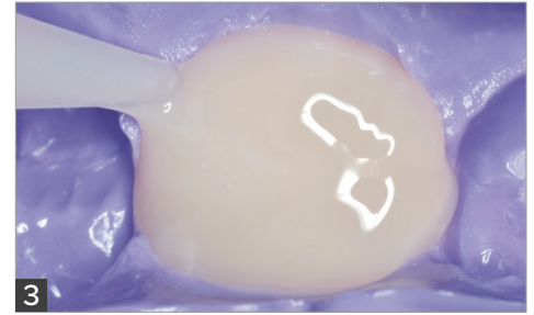
3 Express a small amount of Inspire Provisional Composite through the syringe tip onto a mixing pad. Load Inspire into the Template matrix, keeping the tip submerged. Inspire has a 40 second working time.