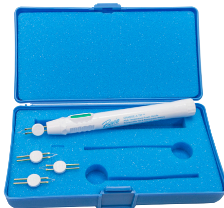
DEL1-Portable Cautery Unit