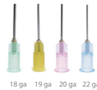
18 ga 19 ga 20 ga 22 ga

Designed for: luting materials and air/water delivery. Use with: TriAway Adapter, PermaFlo™ DC (20 ga), and other Ultradent syringes.