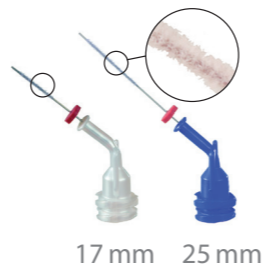
17 mm 25 mm