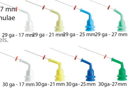
29 ga - 17 mm 29 ga - 21 mm 29 ga - 25 mm 29 ga - 27 mm 30 ga - 17 mm 30 ga - 21 mm 30 ga - 25 mm 30 ga - 27 mm

29 ga delivers paste materials. 30 ga delivers solutions and gels.