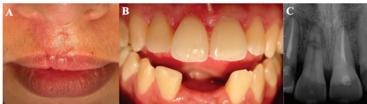
Fig. 1: A) Scar on the right upper lip due to trauma. B) Absence of teeth 31 and 41, avulsed. C) Initial x-ray suggestive of apical horizontal fracture.

After the patient's free and informed consent, a coronary access was performed under absolute isolation by means of dental floss ties and a Top Dam® gingival barrier seal (FGM, Joinville, SC). The working length was precisely determined by the CBTC, at 17 mm, with the palatal face of the tooth as the apical end the (Fig. 2A). Mechanized instrumentation was performed using the Protaper Next system up to the X5 file (Dentsply Tulsa Dental Specialties, Tulsa, OK, USA). Copious irrigation with 5.25% sodium hypochlorite was performed and during each instrument exchange using a 5 mL Luer syringe equipped with NaviTip 30 gauge needles (Ultradent Products Inc., Indaiatuba, SP), inserted into the canal up to 2 mm from the WL. After complete instrumentation, the canal was irrigated with 5 mL of ethylenediaminetetraacetic acid (EDTA, Formula and Action) at 17% followed by application of an intracanal calcium hydroxide medication (Ultracal, Ultradent, South Jordan, UT) for 10 days (Fig. 3A). After the placement of a delay dressing, a slight wear was made on the incisal edge of the tooth. When no signs and symptoms were observed, a 4 mm apical plug was created using Bio C repair Bioceramic cement (Angelus, Londrina, Paraná), with the aid of condensers (Odous De Deus, Belo Horizonte, Minas Gerais, Brazil). Subsequently, the two coronary millimeters were filled with thermoplastic gutta percha, inserted