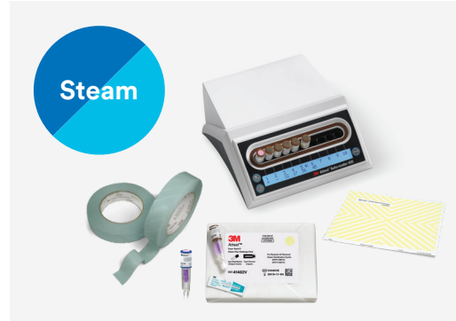
Load Control Pack Control Exposure Control Equipment Control

Our 3M portfolio of sterilization assurance products and sterilization monitoring expertise is your first line of defense in your fight to help protect patients from surgical site infections (SSIs).