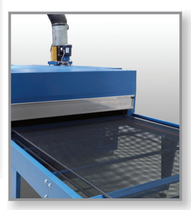
Belt widths, 38" to 72"