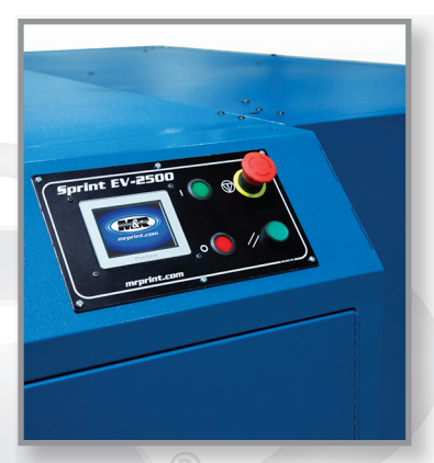
3.5" color touchscreen controller

The affordably-priced Sprint® EV 2500 modular gas dryer curing system has been designed and built with M&R's renowned attention to quality and dependability—all while matching a better price point for your bottom line.