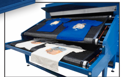
Dual Belts Feed Two Heat Chambers

M&R's Sprint 3000 D is a dual stacked belt screen printing conveyor dryer that utilizes two separate belts to feed independent heat chambers. This gas dryer is designed to take up less room without sacrificing performance and versatility. Each heat chamber and belt can be set at different temperatures and speeds, which makes this an ideal dryer for digital printers or screen printers that need a gas dryer with big performance in a small area.