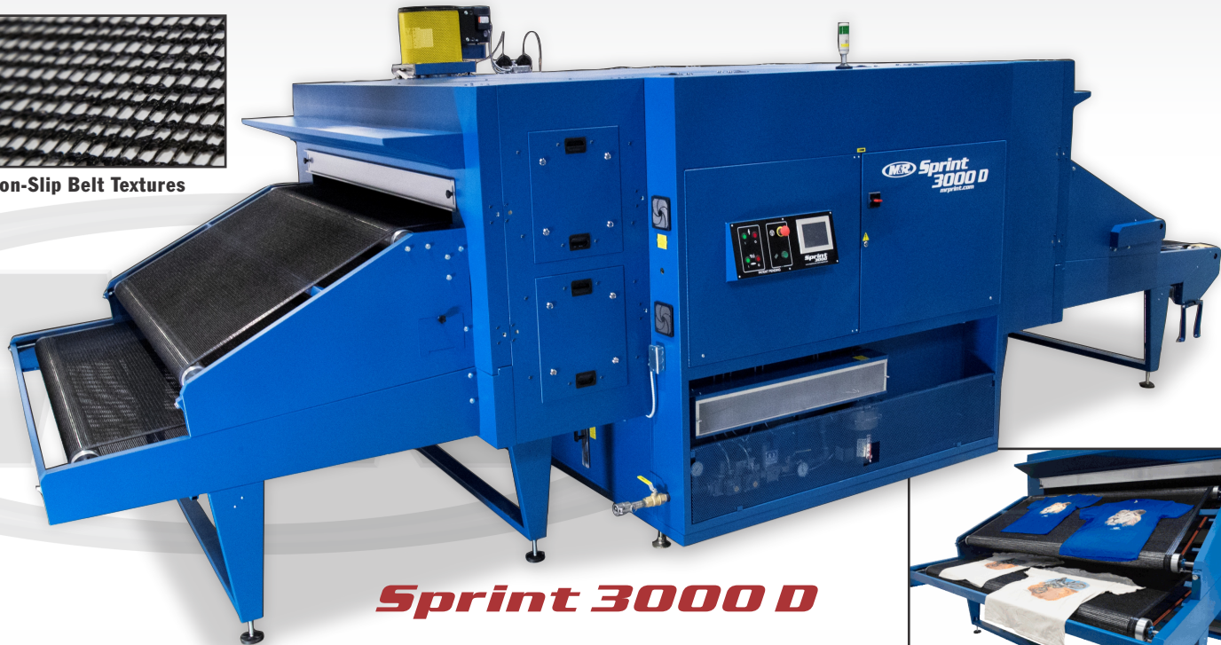
Sprint 3000 D