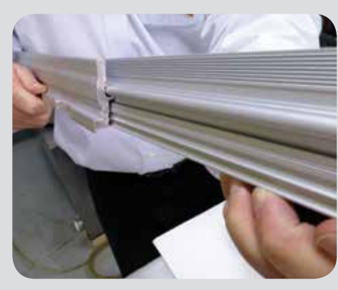
Slide the two pieces together