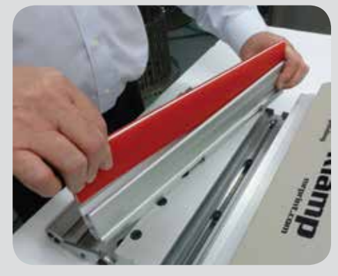
Seat the squeegee blade in the opening between the two sides and place the set between the Qwik-Klamp's jaws