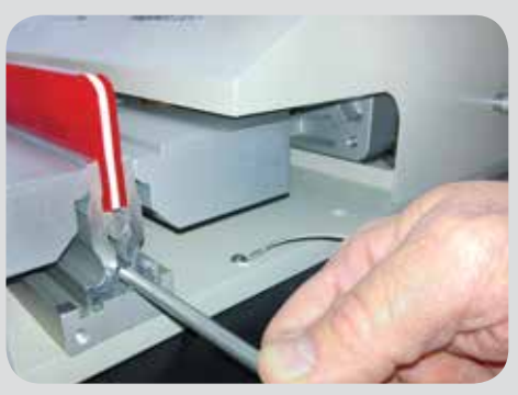
Insert the retaining pin and release the clamping mechanism by pressing either button