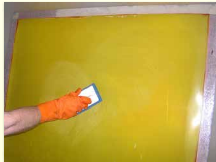
Step 2. Scrub screen with non-abrasive pad or brush.