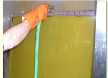
Step 3. Flood rinse the screen starting at the top and washing all residue off the screen.