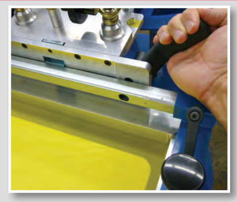
Convenient lever-actuated off-contact adjustment