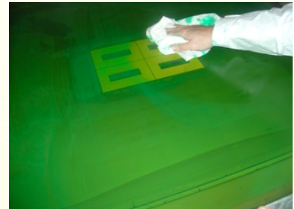
Step 3. Use rags or towels to wipe up ink residue. Re-apply to clean up ink residue in image area.