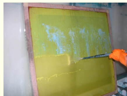
Step 3. High pressure rinse - starting at bottom.