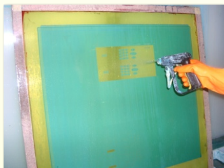
Step 1. After removal of ink, block-out, and tape, apply ER/35® to a wet screen(both sides).

ER/35® can be used in concentrated form, or it can be diluted up to 1 to 9 parts of water. ER/35® can be applied by a sponge, pad, spray bottle, or pneumatic pump systems.