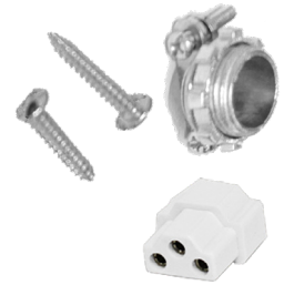
Included Accessories: End-to-End Coupling Mounting Screws