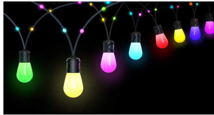
Light On View