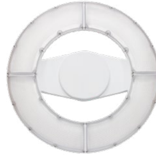
Multi-level Occupancy Sensor PIR Occupancy Sensor with Daylight function Code-compliance