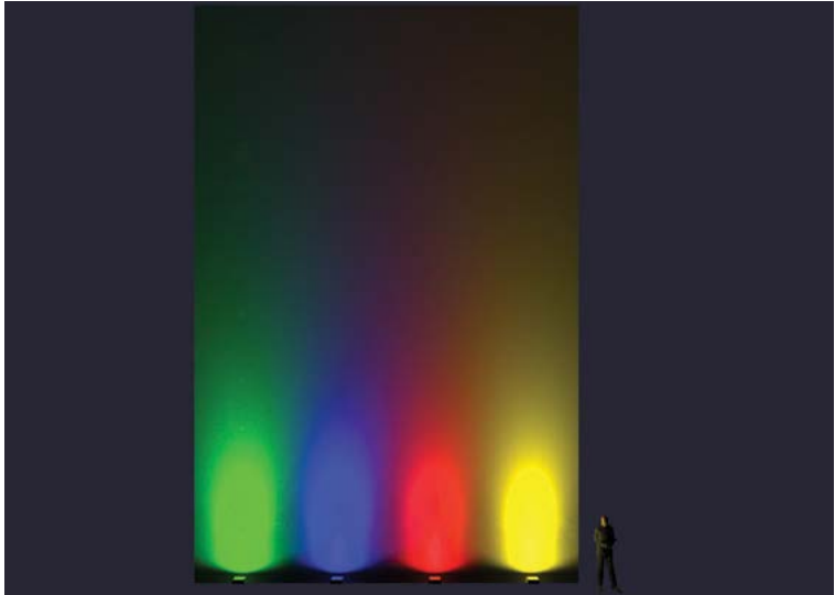
I Optic, 30°H x 30°V, NEMA 4Hx4V