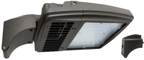
KH25Q with Kitty Hawk Arm (KA)

Kitty Hawk Die-Cast Mounting Arm, Bronze Powdercoat Finish, Includes Hardware. Mounts Directly to Square Poles.