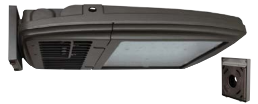
KH25Q with Easy-Hang Bracket (EH)

Two-Piece Stamped Steel Adjustable Bracket, Bronze Powdercoat Finish, Includes Hardware.