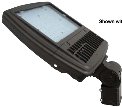
Shown with "SF" Slipfitter Option.