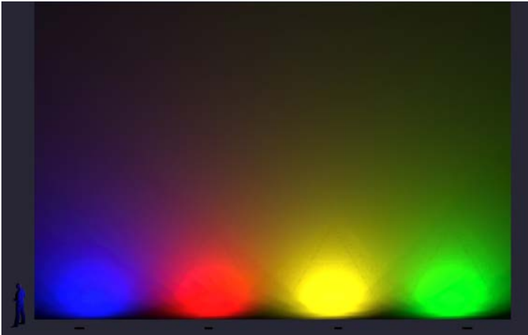
F Optic, 110°H x 110°V, NEMA 7Hx7V