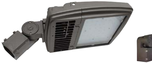
KH25Q with "SF" External Mount Slipfitter (SF)

Stamped Heavy-Duty Steel Yoke, Bronze Powdercoat Finish, Includes Hardware.