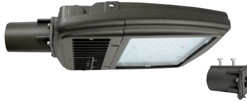
KH25Q with Pole Mounting Arm Adaptor (MA)

Kitty Hawk Die-Cast Mounting Arm, Bronze Powdercoat Finish, Includes Hardware. Mounts Directly to Square Poles.