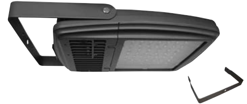
KH25Q with Yoke (Y)

Die-Cast Adaptor for 2 3/4" Horizontal Mounting Arms, Bronze Powdercoat Finish, Includes Hardware.