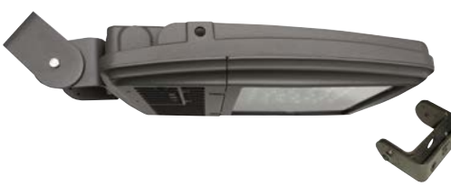
KH25Q with Two-Piece Swivel Bracket (BR)

External Mount Die-Cast Adjustable Slipfitter for 2 3/4" Tenons, Bronze Powdercoat Finish, Includes Hardware.