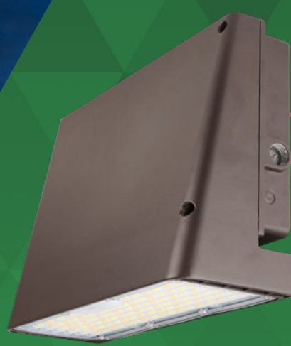
TUNABLE POWER & CCT: 100W