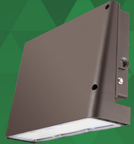
TUNABLE POWER & CCT: 38W / 65W