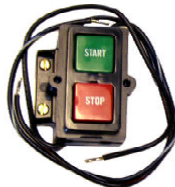
P/N STARTER-START-STOP SS3-NB START / STOP P/B Assembly