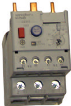
P/N STARTER-HEATER-RLY CEP7-EEFD FOR CA7-30 TO CA7-43 / 9-45AMP