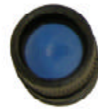
P/N STARTER-ENCLOSURE M1-130706-7 N1 Enclosure for S&S with Back Plate & Reset Button

Option 2 15 h.p. Electric Motor Starter Spare Parts