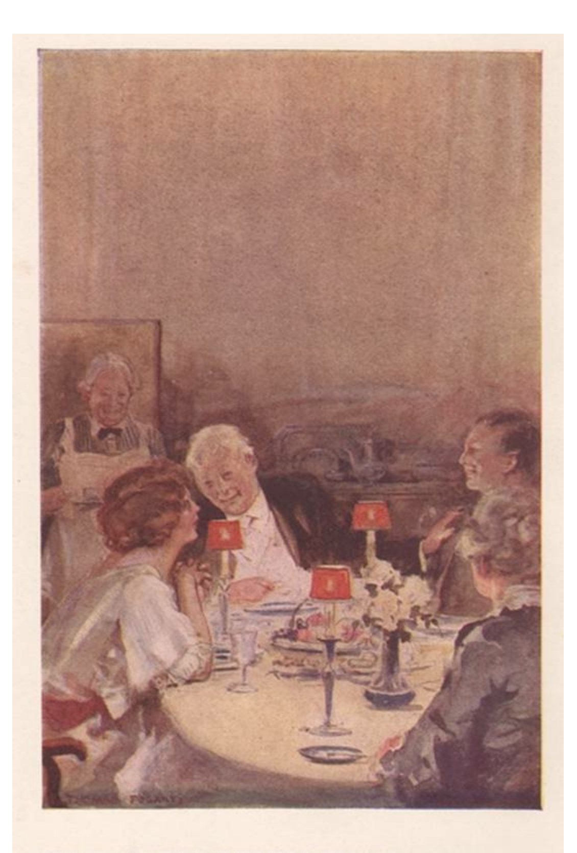
THEY WERE VERY GAY IN THE OLD BRICK HOUSE THAT NIGHT.