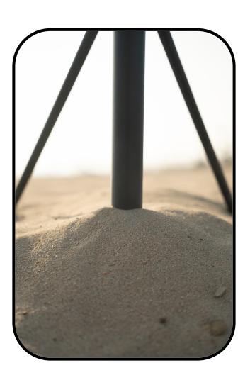
*Make sure to Fully Cover Front Side of Base