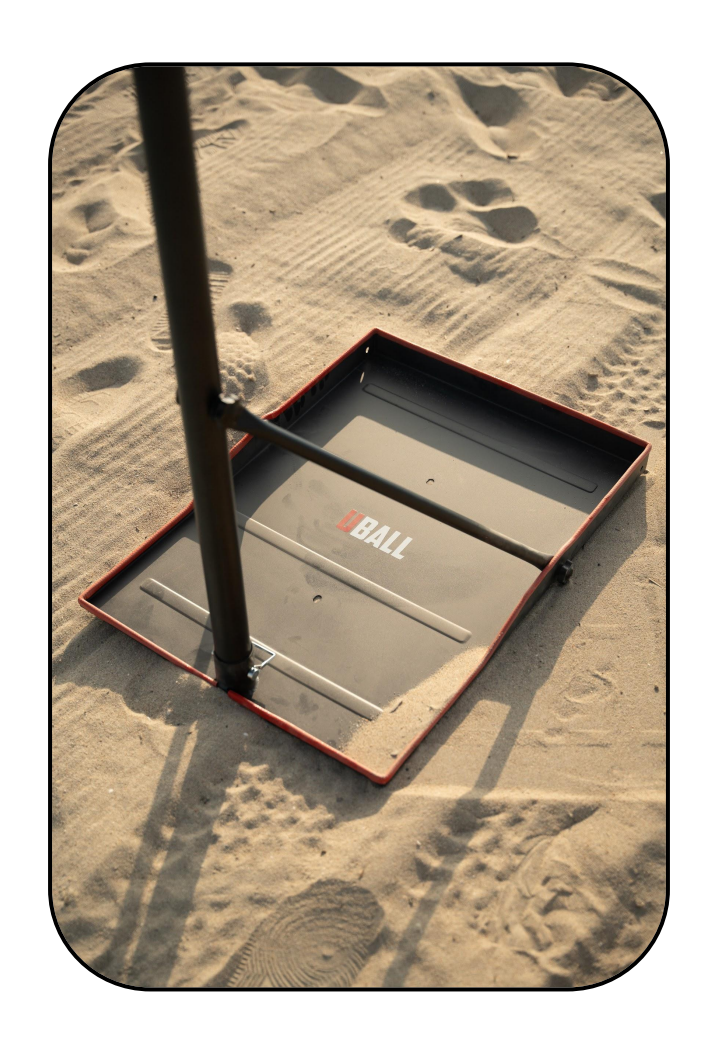
Base Assembly Complete