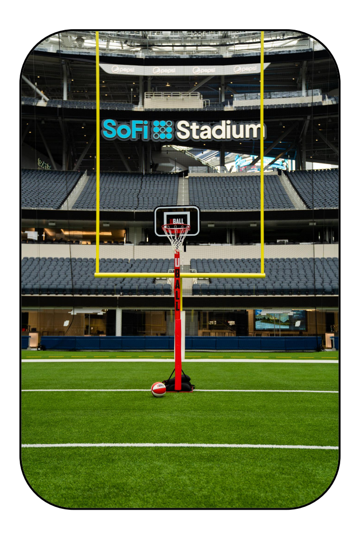
Final Assembly Complete