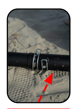
Fasten with Silver Lock Pin