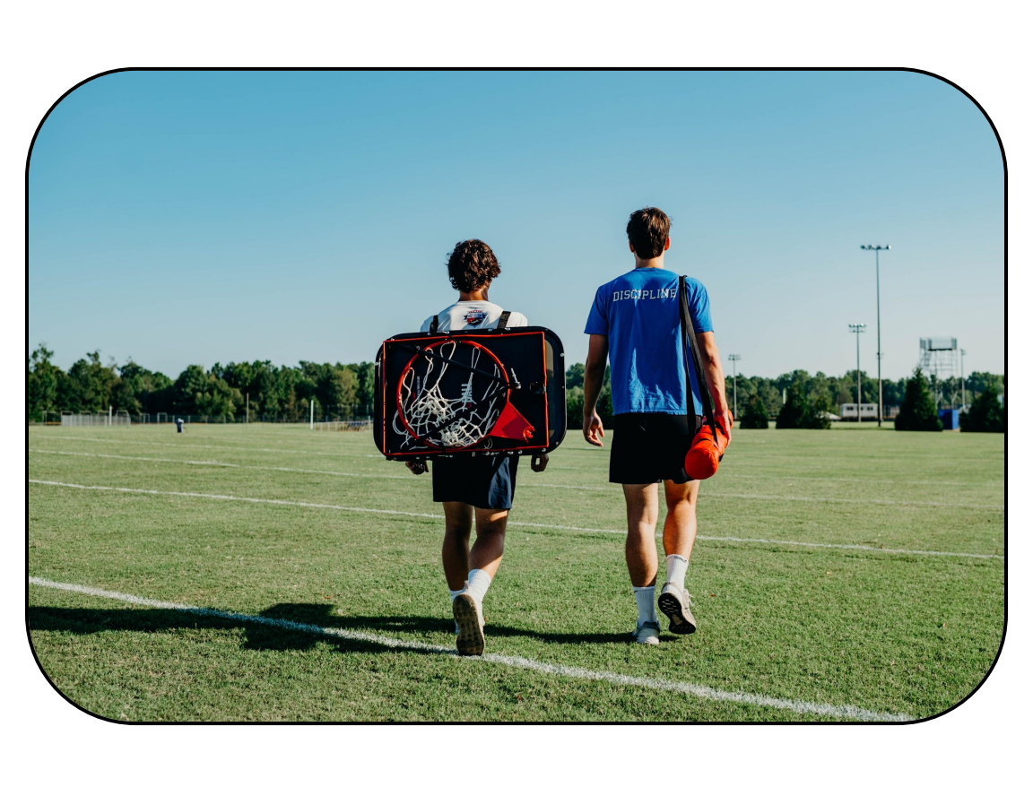
Place Poles in Travel Case & Backpack Form Complete