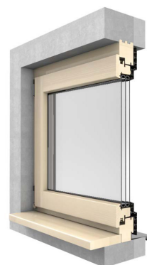
Wood + Aluminum Classic