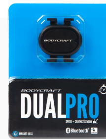
OPTIONAL BLUETOOTH / ANT+ DUAL SPEED & CADENCE SENSOR