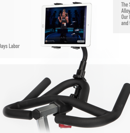
OPTIONAL TABLET HOLDER