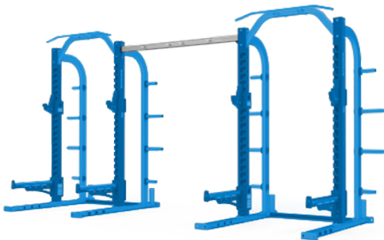
PULL UP BRIDGE* 9-HDPB1-26

*Available for connecting multiple racks together