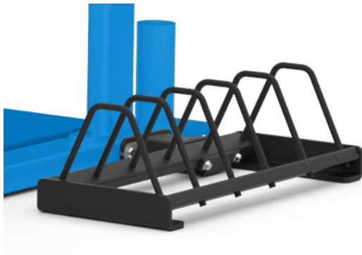
OPTIONAL BUMPER PLATE FLOOR STORAGE 9-HDCS1