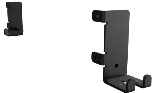
OPTIONAL VERTICAL OLYMPIC BAR STORAGE* 731-9299-KT

*Kits are available to protect walls during bar storage.