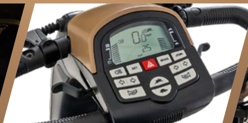
User friendly console