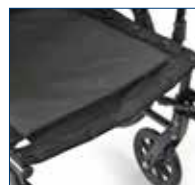
2" upholstery seat extension