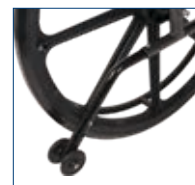
Adjustable anti-tippers with push-pin flip-up wheels