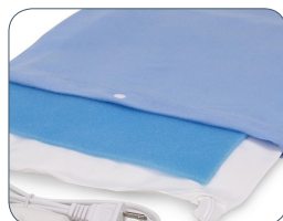
Sponge insert for deep penetrating moist-heat therapy