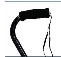
Soft cushioned handle with wrist strap