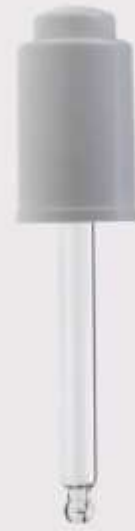
Push Button Dropper