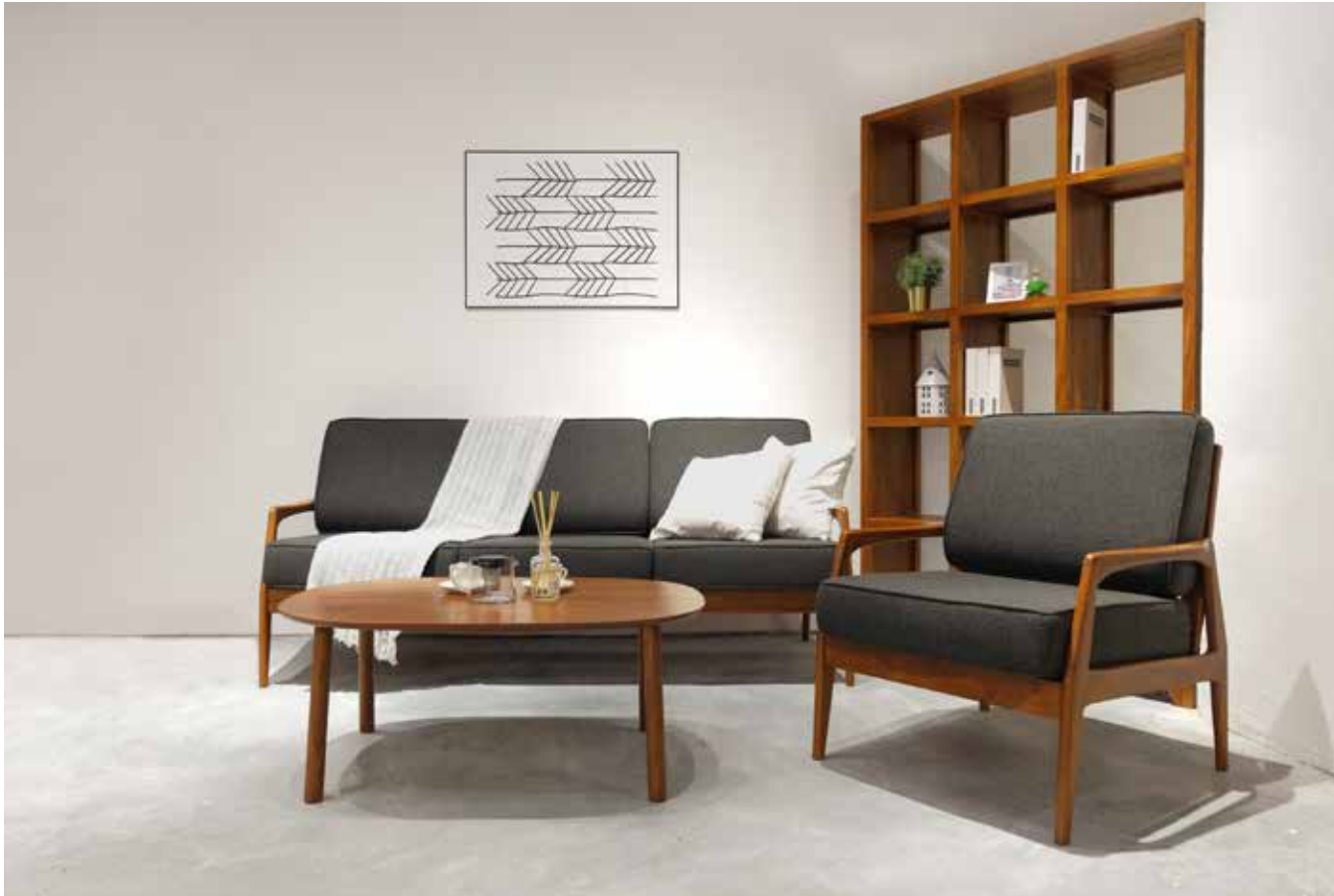
ISLAND COFFEE TABLE