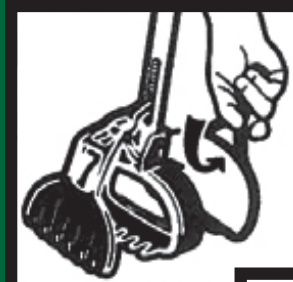
1. Pull BAG CLIP down and back to remove.