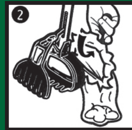
2. Pull bag clip down and back to release bag.

Uses Common Bags! (Grocery bags, kitchen bags, etc.)