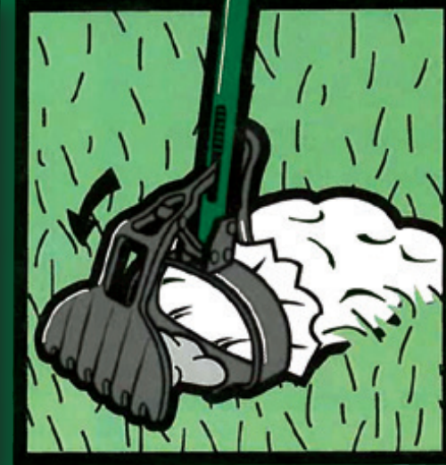
Place and Squeeze Lever to Scoop.