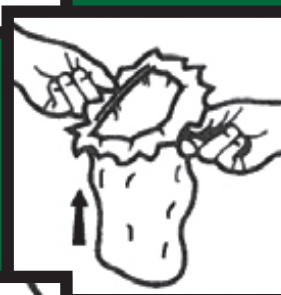
2. Place bag in BAG CLIP and fold over rim like a garbage can.