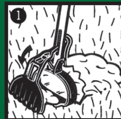
1. Position bottom teeth under debris and grasp hand lever.