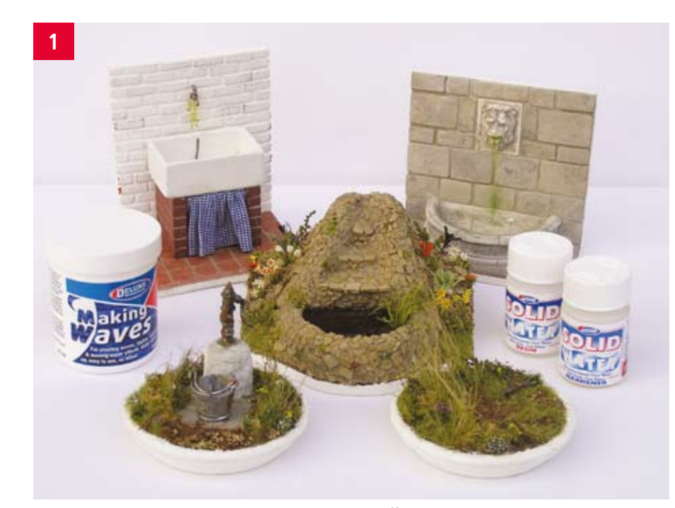
Have your original items to hand ready to add the water effect.