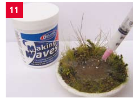
You can make raindrops by syringing small threads of Making Waves up from the surface of the Solid Water puddle.

The puddle with its surface stormy ripples was made using Solid Water mixed with a few strands of Deluxe Materials Scenic fibres and allowed to set completely. Don't forget to add raindrops!