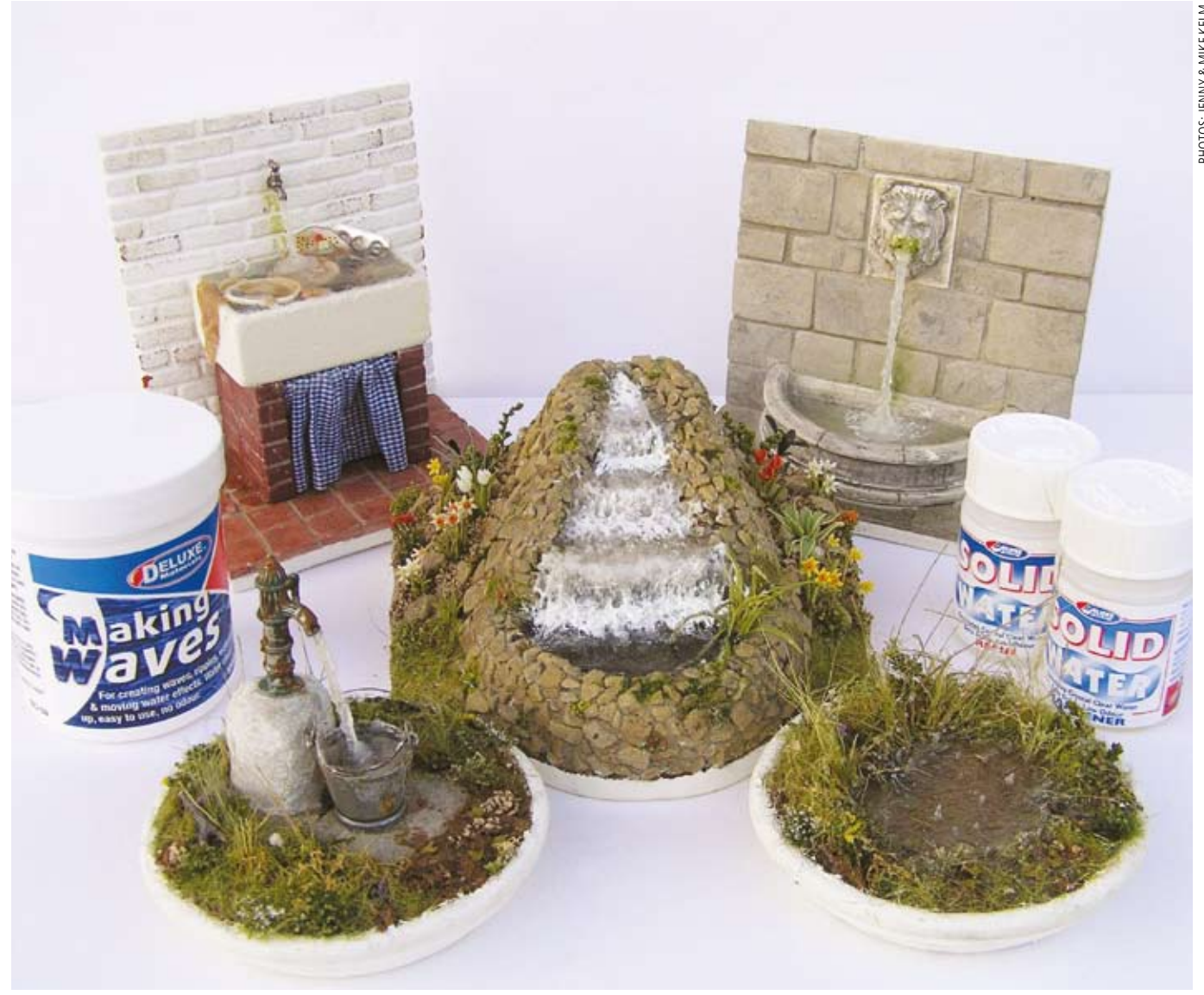
Items inside the dolls' house and outside in the miniature garden come alive using the Making Waves product from Deluxe Materials.

Catherine Davies demonstrates how to recreate the effect of moving water in your miniature scenes