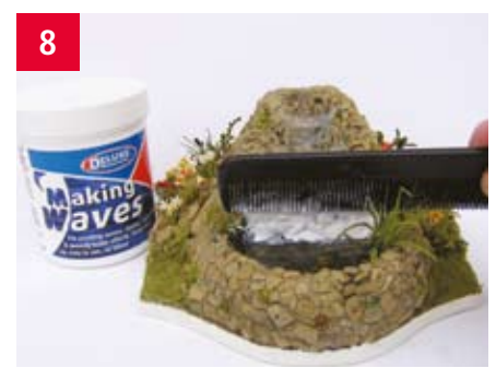
Pressing a comb against the wall of Making Waves helps to create uniform deep ripples. You can 'draw' individual ripples through Making Waves using a cocktail stick or a pin.

■ Layer Making Waves using different amounts of colour to create the illusion of varying depths and speeds.