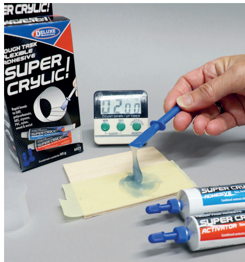
Above: The adhesive starts to set immediately after mixing and remains mobile for up to two minutes. Its flexible nature is very evident soon after it is mixed.

Packed in aluminium tubes, the adhesive has a good shelf life and can be stored for up to a year.