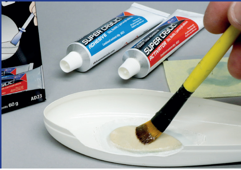
Left: SuperCrylic! is thin enough to laminate with using 1oz glass cloth.