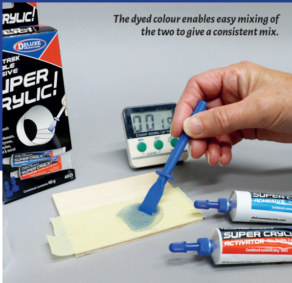
The dyed colour enables easy mixing of the two to give a consistent mix.