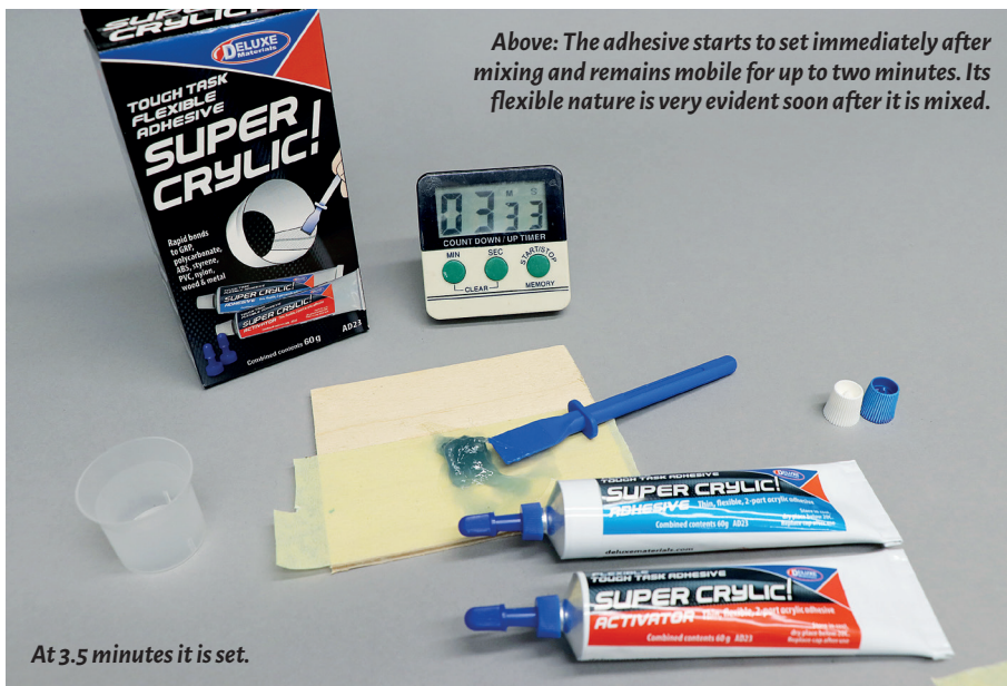
At 3.5 minutes it is set.