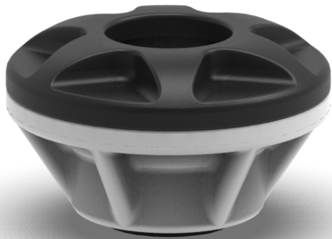
A6 Top Spanner For Installation of A6 Part Number: TM-C1040A

The A6 Pressure Relief Valve is ideal for any application where compactness and reliability are critical. The opening and closing pressures are accurately pre-set and repeatable.