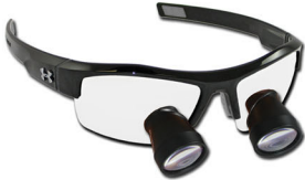
SureFit TTL Loupe