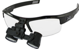
Signature Flip-Up Loupe