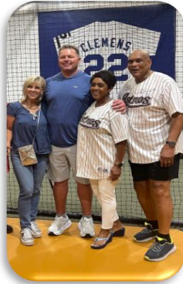
Linda Lorelle Scholarship Fund