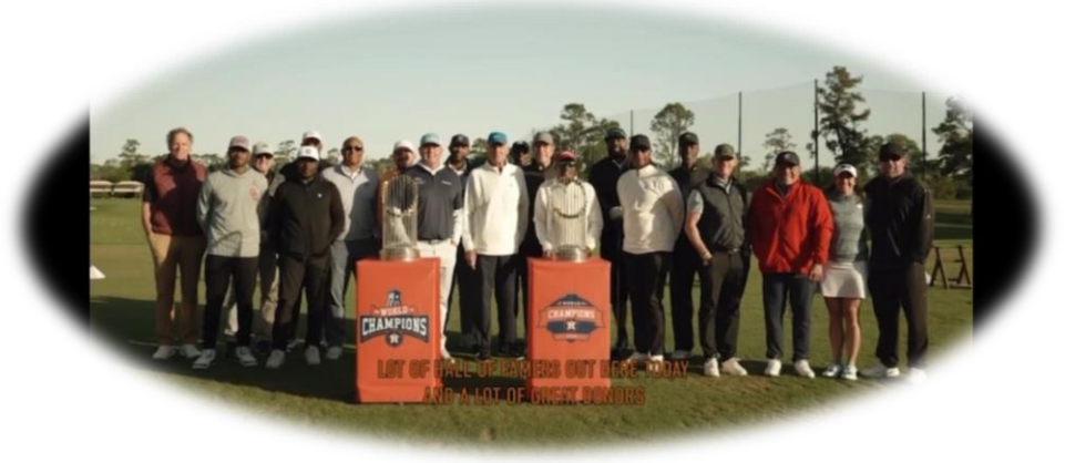
Roger attended the kickoff to the Houston Open, Jim Crane's Celebrity ProAm, which benefited the Astros Foundation and the great work they do.

Rocket was all over the map in Houston and its surrounding area fundraising and promoting our Foundation and making a positive presence in our community.