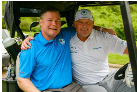
Supporting Waste Connections' Annual Golf Classic for Kids as they have supported our Foundation for years. We so appreciate them!