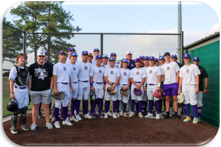
He threw a First Pitch for a Montgomery High School Baseball Game