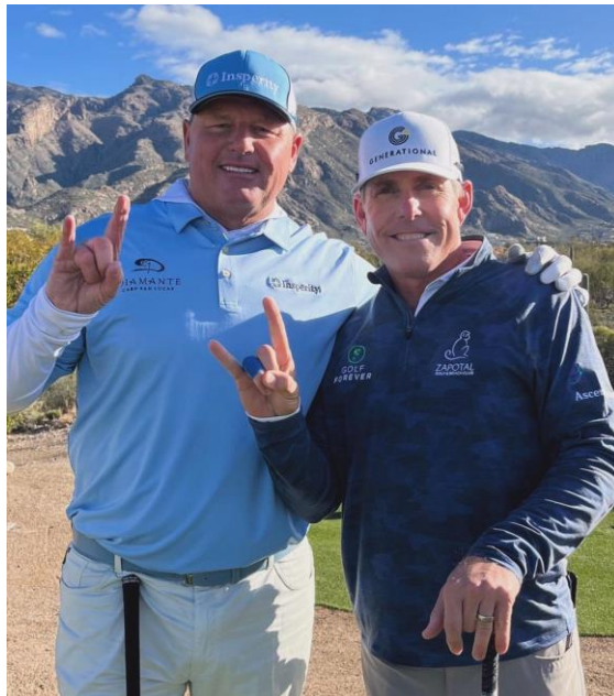
Wearing his BLUE in support of Colon Cancer Research at the Colguard Classic in Arizona.