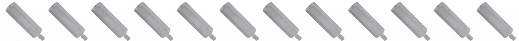
Stand-offs 30mm (12)