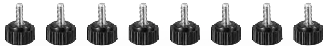
Thumb Screw (8)